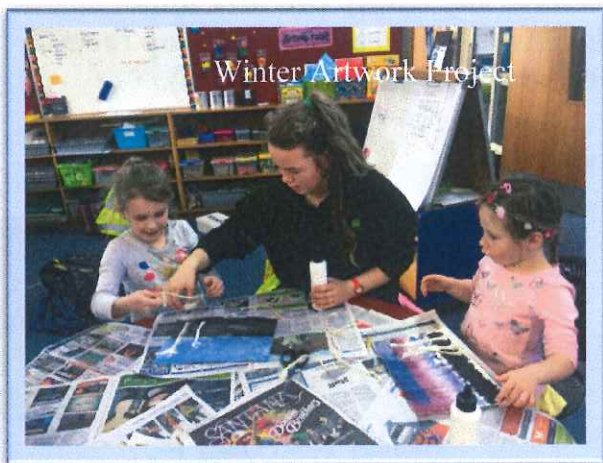
Winter Artwork Project