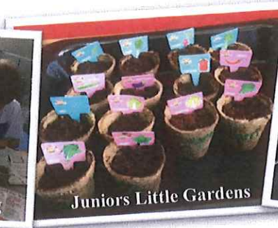
Juniors Little Gardens