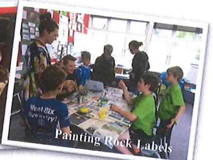
Painting Rock Labels