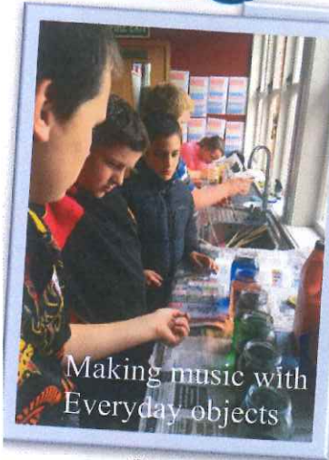
Making music with Everyday objects